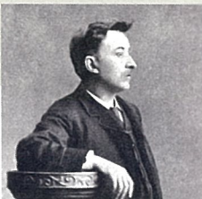
Patrick Lafcadio Hearn