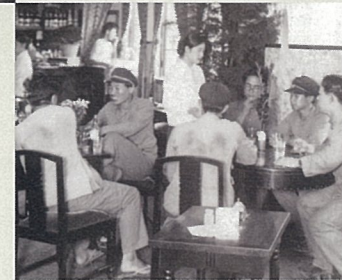
At a coffee shop