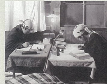
Study in a dormitory